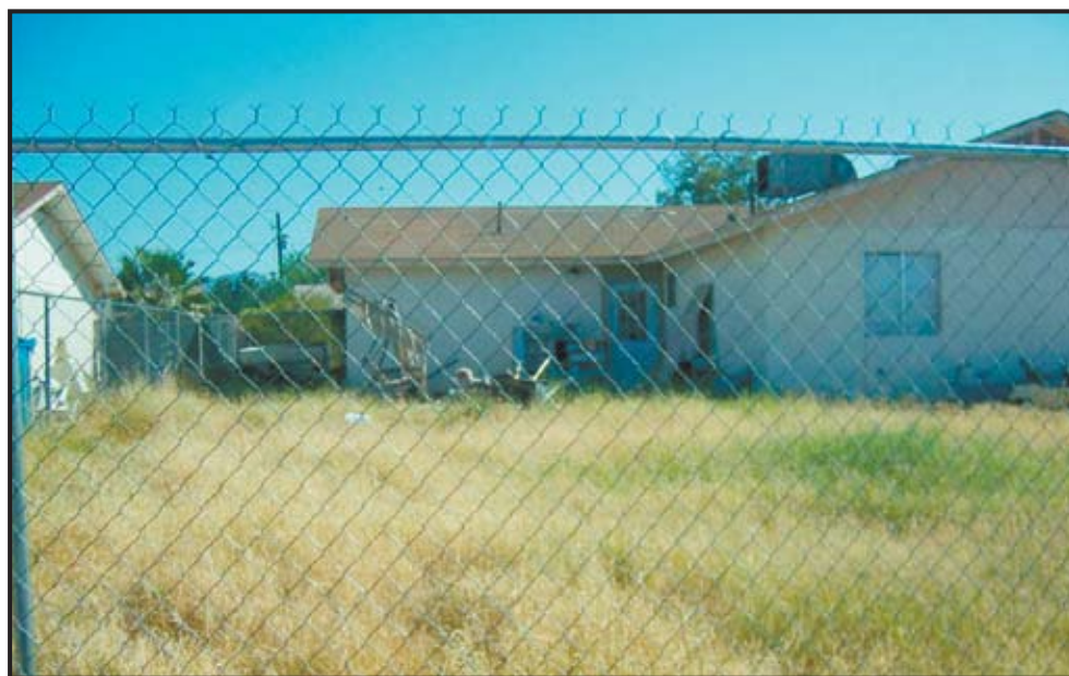
Ninety-eight percent of the City's code compliance cases are settled voluntarily without having to go to court.

"That usually takes care of it," Steinke said. "In fact I will tell you 98 percent of our